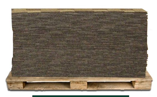
1 sq. of Timberline Ultra HD® Shingles

Timberline Ultra HD® Shingles are up to 53% thicker than standard architectural shingles.**