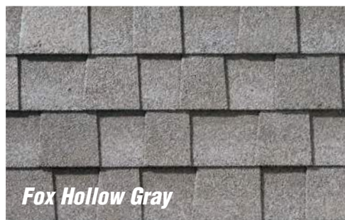
Fox Hollow Gray