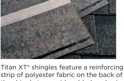
strip of polyester fabric on the back of the shingle to provide added anchoring for the expanded nailing zone.

Introducing an industry first — a high wind warranty with coverage up to 160 MPH , with only four nails installed in the expanded nailing zone, when using TAMKO® Starter.† Inspired by the combined performance of our AnchorLock™ layer and Advanced Fusion™ sealants to help the shingle hold fast.